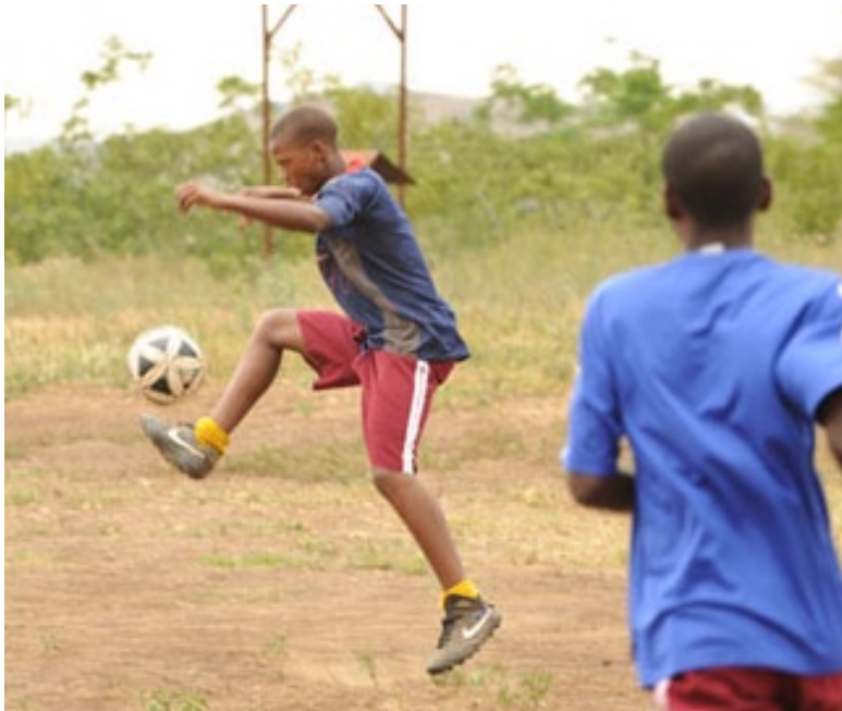
Football at PHS