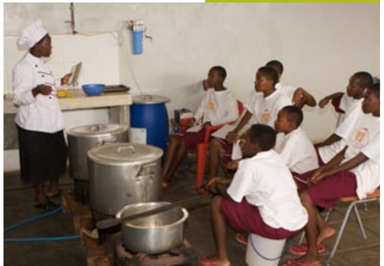
Extra-curricular activities at PHS