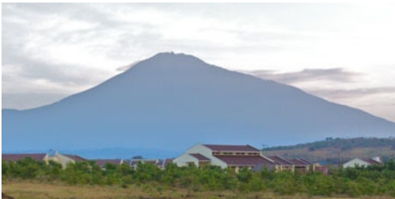
View at PHS