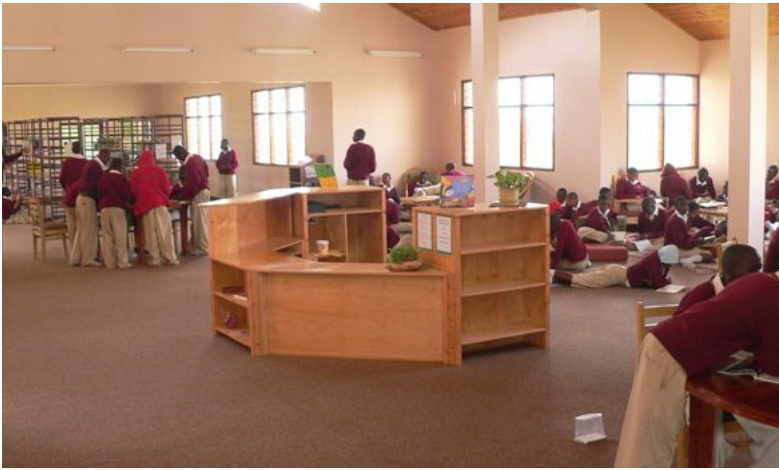
Kirchner Learning Center at Peace House Secondary School